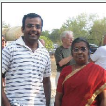
New Faculty Orientation 2006